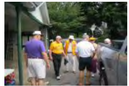
Some of Our Lions gathered at the old Marshall Estate to sell hot dogs, sodas, and potato chips.