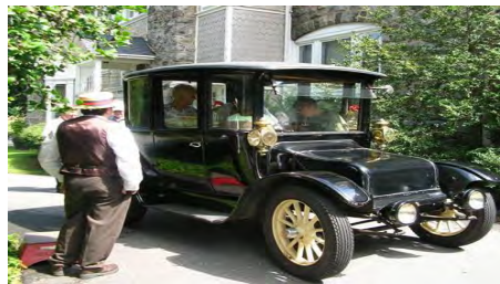
Some Stanley Cars below (1902 to 1922)

All guests for the occasion were transported from the parking lot to the main drive via "steam car" Below is a 1916 Rauch & Lang Electric Brougham.