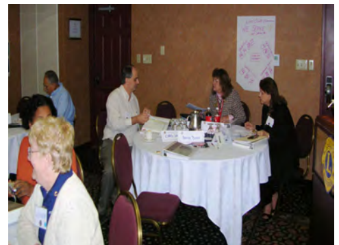
Lions talking over their project.