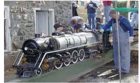
Some took a train ride, looked at cars, like a 1932 Packard Phaeton Model 905 or .....