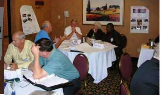
Lions working on assigned group project.