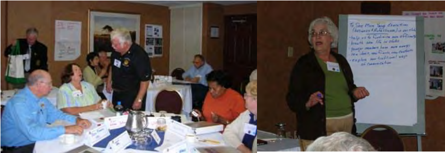
Lions working on assigned group project.