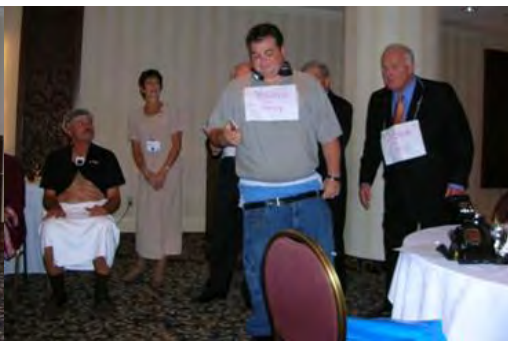
A short skit performed on Lionism.